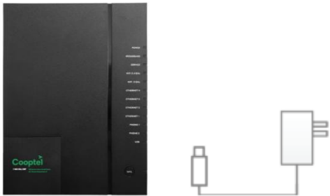
Routeur Gigacenter 844 E ou 844 G et bloc d'alimentation