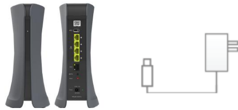
Extenseur Mesh 834-5 et bloc d'alimentation