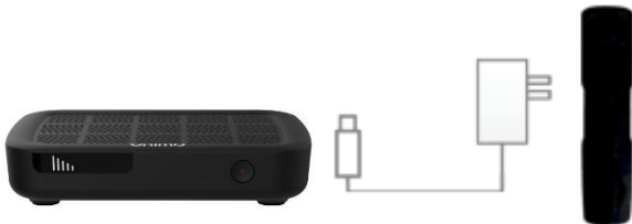
Kamai wifi, bloc d'alimentation et télécommande