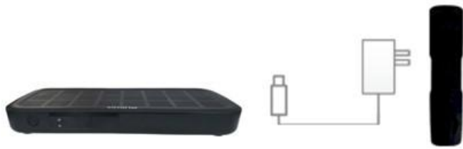
Amulet, bloc d'alimentation et télécommande