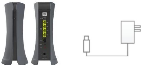
Routeur Smart 834 et bloc d'alimentation