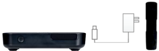
Kamai, bloc d'alimentation et télécommande