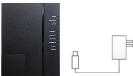
Modem fibre ONT