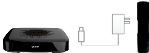
Kamai 650 ou 655, bloc d'alimentation et télécommande